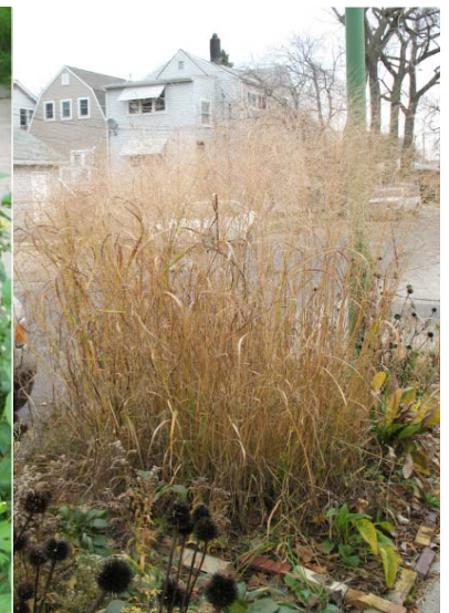
Shari's parkway garden featuring Switch Grass (Panicum virgatum) Fall - 09