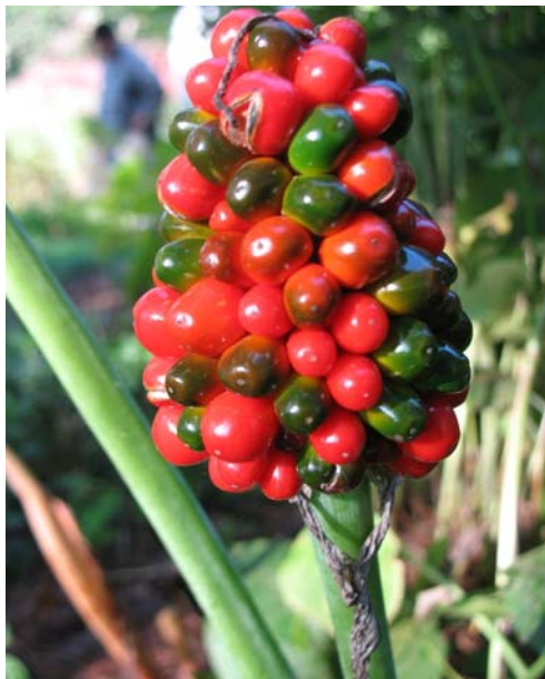
(Above) Bright red seeds of the Jack-in-the-Pulpit (Arisaema triphyllum), in seed during the Fall