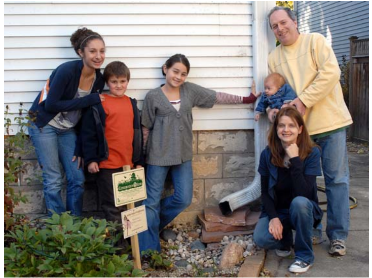
(Above) The Sherman Family of LaGrange, gathered around their newly created rain garden and downspout in Fall, 2009.