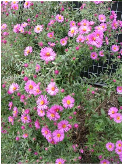
New England Aster (Aster novae-angliae)