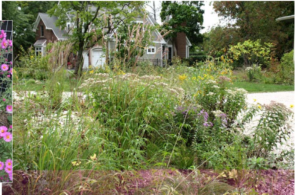
Nice garden around a sculptured berm in Glenview, IL