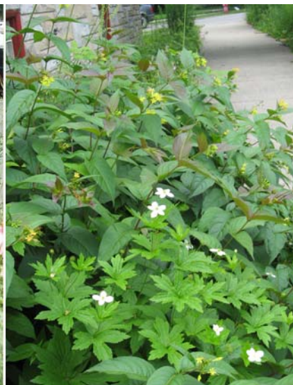
Mistflower (Eupatorium coelestinum) and Meadow Anemone (Anemone canadensis) Summer - 09