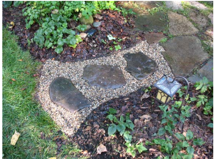
(Above) A small path composed of flagstone and pea gravel from the lawn to the patio.