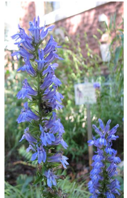
Great Blue Lobelia (Lobelia siphilitica)

Our gardens are creative and inspiring and you will be very happy with them. An enthusiastic agreement, a small down payment and a signed contract are all that are necessary for us to start. The plants and our work are guaranteed for one year.