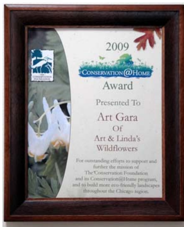
The much-coveted, Conservation@Home Award